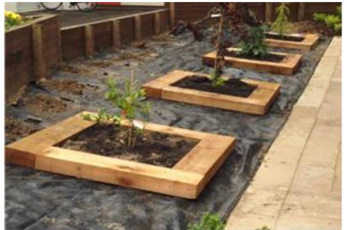
The Heritage Garden taking shape

Viewing the Year 11 Show Gardens. More details about these gardens and the winning group in next week's BartholoNews.