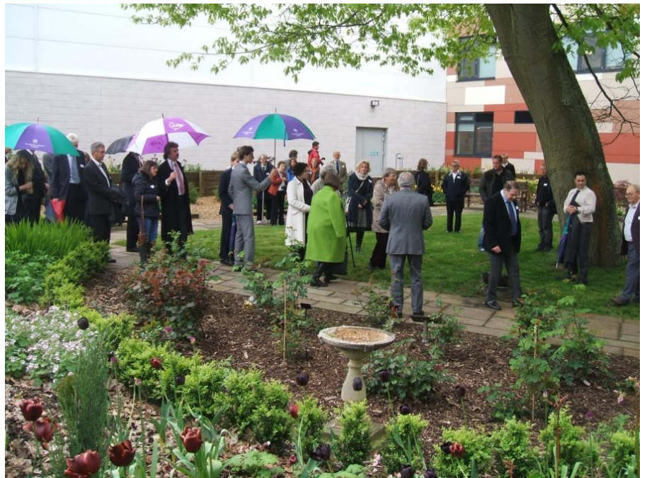
Visitors looking around the Heritage Garden