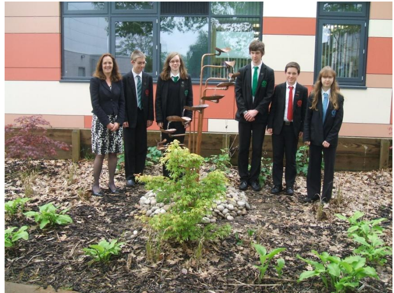
The new water feature