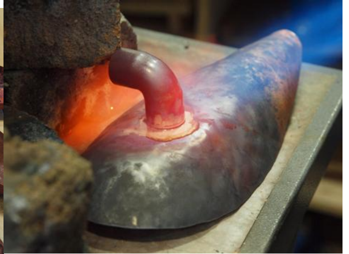
The water feature under construction