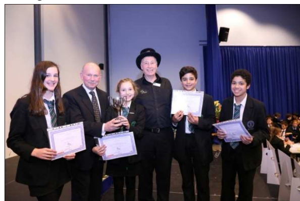
Team 1 – photo courtesy of K T Bruce Photography

Team 2 were awarded certificates by the Chairman of Oxfordshire County Council for finishing 3 rd .