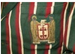
ONA blazer badge