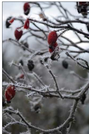
1 st Place Emma Street 7D1 (left)

We are pleased to announce the winners of the Autumn2 competition Reflections of Winter.