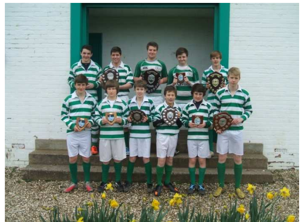
Picture shows captains and other representatives from each of the school rugby teams.

At the same time, the Year 7 boys finished 6 th out of 42 teams in the County Festival, Year 8 boys narrowly lost in the County Final and the Year 9 boys were losing semi finalists in the same competition. The Year 10 boys were impressive in the national Daily Mail Cup Competition reaching the fourth round of the main competition before suffering a defeat which was their only loss of an otherwise unbeaten season.