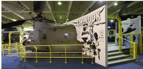
Chinook - Big Windy in the RAF

For their CCF field day cadets from Year 10 visited RAF Hendon in London to learn about the history of flight and they were asked to complete a questionnaire of the Milestones of Flight Exhibition.