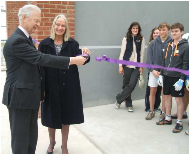
Opening of the new Eton Fives courts