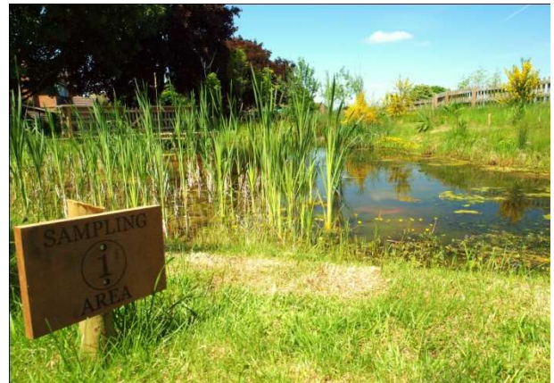
The nature reserve