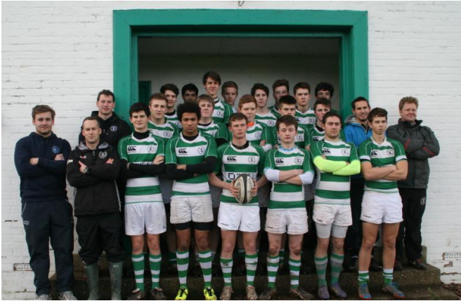
1st XV squad v ONA. More pictures can be viewed on the ONA website at the following link.

with the loose ball for the winning score. Although it was heart breaking for the school the whole squad could be proud of their performance and for putting on an excellent entertaining display of rugby.