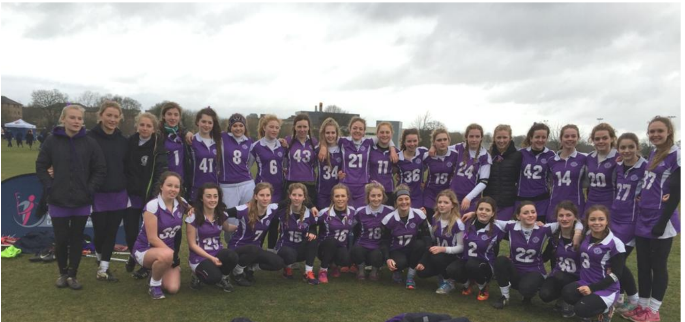
The senior teams

This meant we finished 5 th out of 6 teams in Division 2.