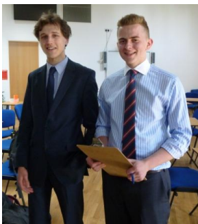
Sixth Form helpers at the school polling station