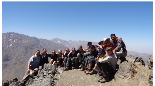
Picture from the 2014 expedition

6.00pm – 7.00pm, Curnock Breakout Space Parents and current Year 8 students are invited to attend the launch of the 2016 expedition to Morocco. The expedition is to the Atlas Mountains and will take place during May half term next year.