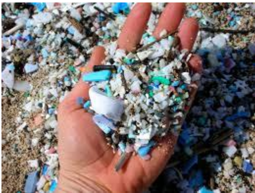
Microplastics on the shore