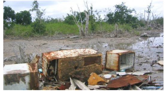
Dumping of used goods on Tonga

on the blue tide, but lurking just beneath the surface to choke the marine life and the sea itself. But not only did Penn realise what harm our man-made plastics were causing to the seas and its species, she soon saw their detrimental effects on land, and most significantly, to ourselves.