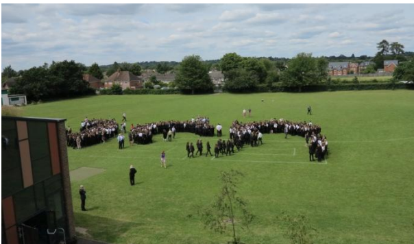
550 taking shape