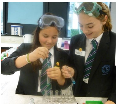
Some science demonstrations

Prospective parents and students were free to look around the school and student volunteers acted as guides and demonstrated and talked about their work in each faculty area. The school was alive and buzzing and the exhibits around the school displayed the high quality of students' work and all the faculties had exciting activities running, giving a flavour of what learning at St Bart's means.