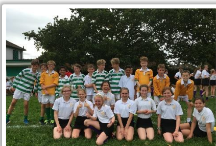
Patterson Year 8