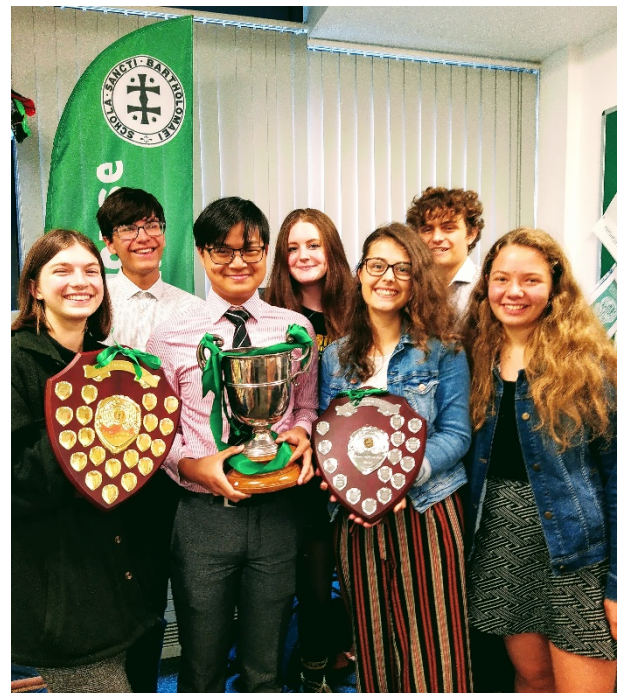
Curnock students were delighted to win the 2019-20 House Cup!