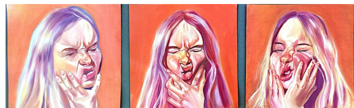
Honor. A-level Art. Acrylic.

You can see works in progress, and preliminary projects leading to GCSE and A Level qualifications on the Open Studios portfolio here .