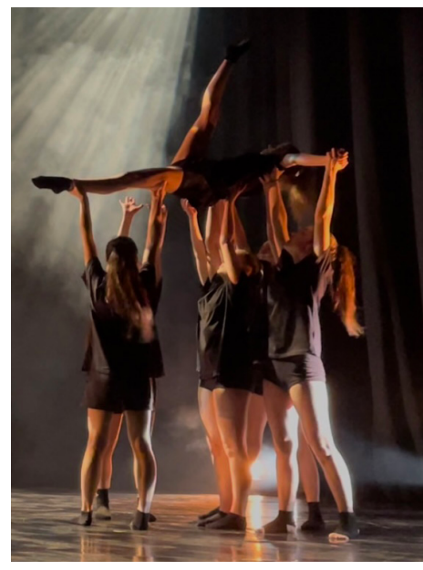
I have felt incredibly welcome at St Bart's Sixth Form, since joining in September. I feel part of a community."