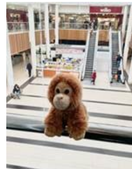
Attenborough, Geography's mascot

In Week 6, on Wednesday and Thursday, we set off on a great field trip to Reading for a one-day trip. For our Human Geography field trip, we had to investigate the multiple factors that we can use for our final data. Reading had many great places that we were amazed seeing, like the Oracle and the Broad Street Mall. The trip was very amazing and enjoyable, meeting people who lived there, visited there, and so on. Even though we had harsh times, mainly due to the heavy weather consisting of wind and rain, at the end we got our results and departed back to school. From other students' reviews, the trip was enjoyed and rated at a good score. I'm sure everybody who went enjoyed it. From this trip we have achieved teamwork, taking responsibility and bravery. Thanks to all the Year 11 students and teachers who participated in this.