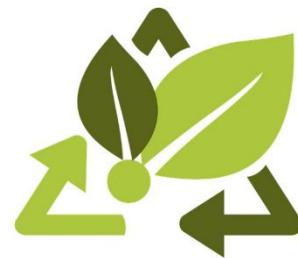
St Bart's Eco Club

For food, we are planning on researching the environmental impact of the food in the canteen and developing a traffic light system. We are looking at developing a school map of the numerous trees as an emphasis on what we have to be proud about and have discussed a tree planting initiative. We are also considering a trip to follow the school's waste and we are hoping to follow up the research on air pollution as part of an investigation which began last year. We have just set up an Instagram page ( @stbartseco ) and have another meeting on the 22 November in C117 at 3.20pm. If any of those ideas interest you, please come along!