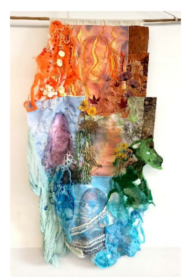
A Level Textiles. Bianca.