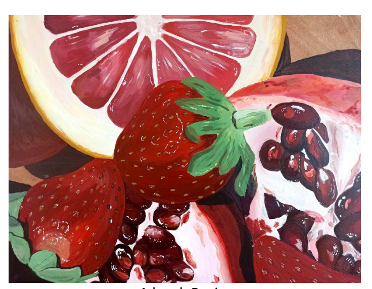
A level. Rosie.