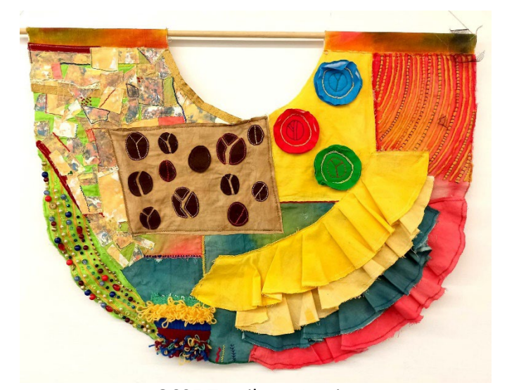
GCSE Textiles. Marcie.