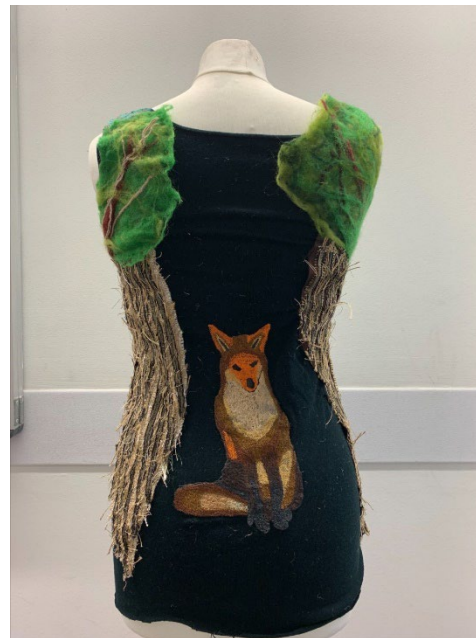
'Fox & Tree Dress' KS4: Ayla (11D3)