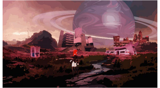
Nyle, A Level Textiles