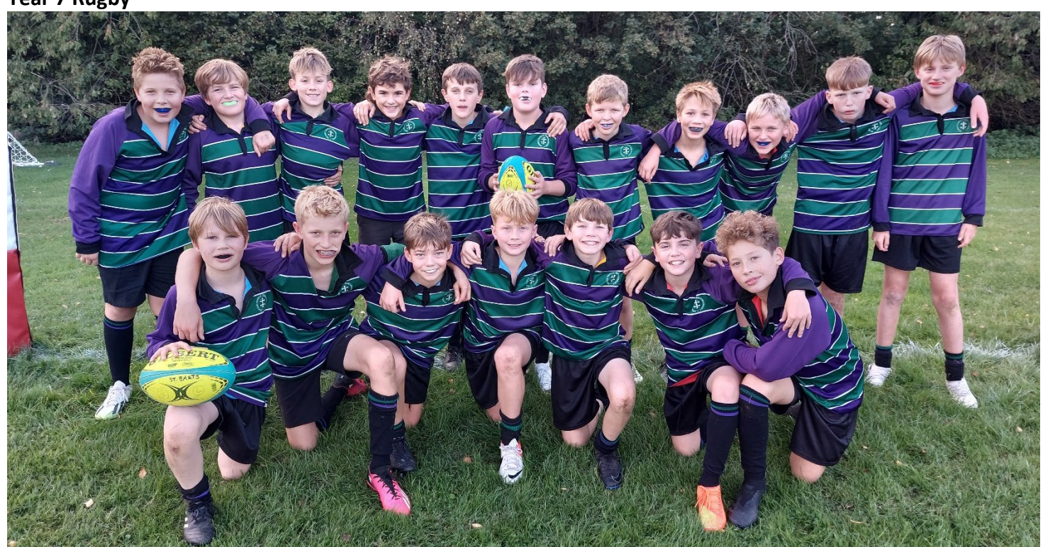
PE Year 7 Rugby