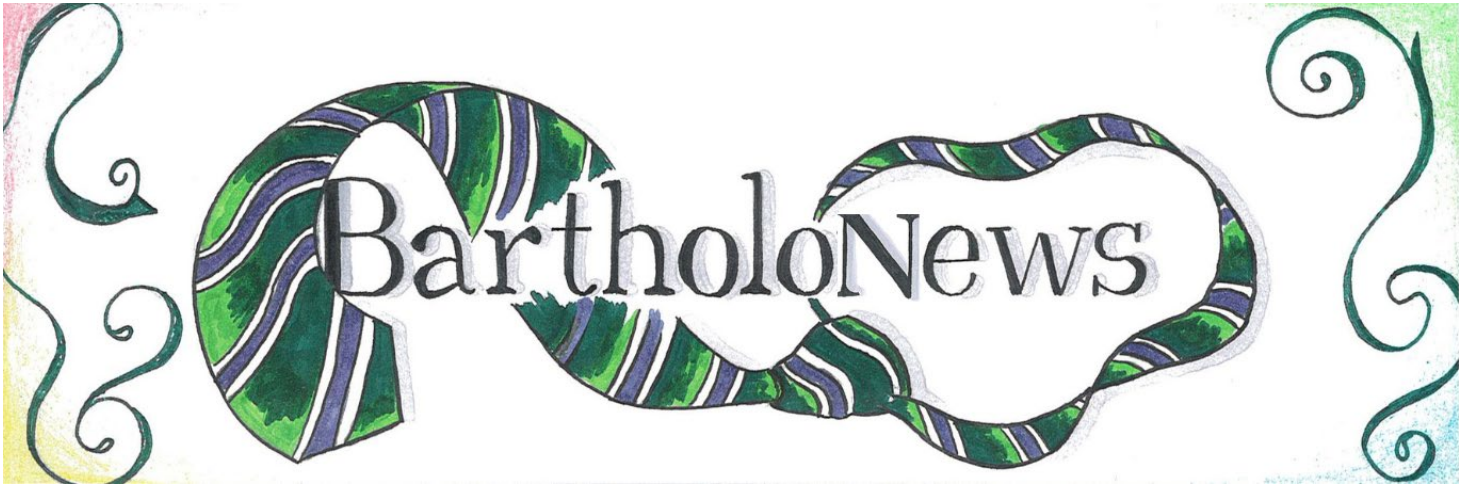
Designed by Gauravi Deegwal (9C1)