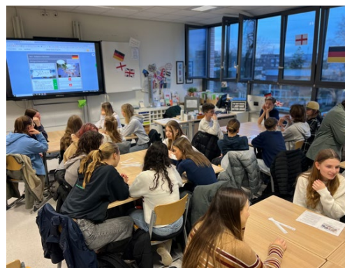
Ice-breaking activities in the German classroom

There are more photos from the trip on our website .