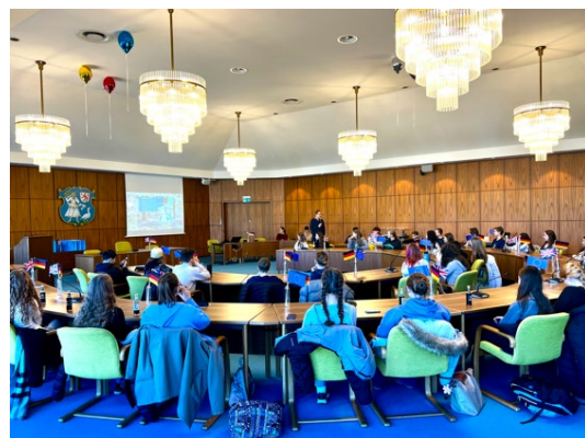
Welcome at Monheim Town Hall by the mayor of Monheim