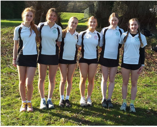
Year 10 Girls