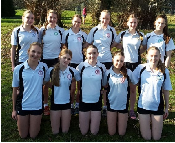
Year 8 & 9 Girls