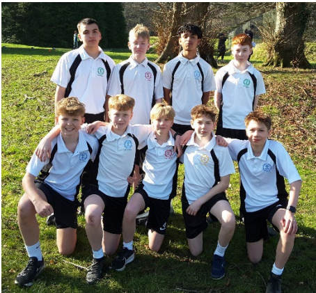
Year 8 & 9 Boys