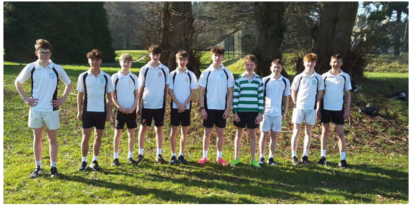
Year 10&11 Boys