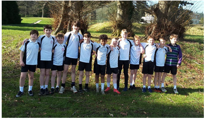
Year 7 Boys