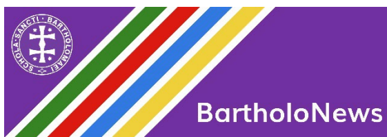
Alana Greenwood (10C2)