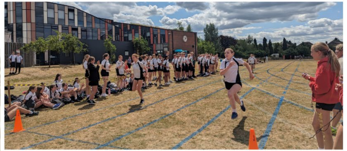
School Sports 2025 - 100m