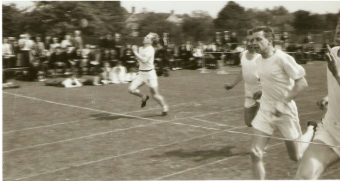
School Sports 1960 o/17 220yds