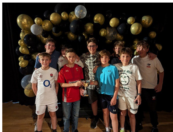
Team of the Year (Boys): Year 7 Rugby

A huge well done to all of our students that have represented us at fixtures and festivals; we can't to see what you achieve next year!