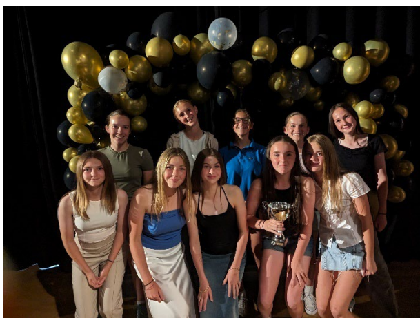
Team of the Year (Girls): U13 Girls' Football